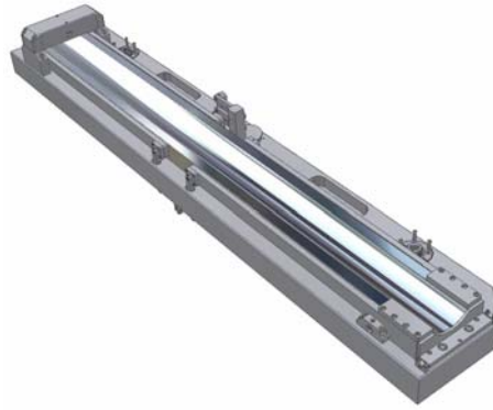
FIGURE 3. MIRROR BENDER AND BATHTUB

The mirror is secured to the 304 stainless steel “bathtub” that provides both mechanical support and water cooling to the optic. Indalloy 51, with a thermal conductivity equivalent to stainless steel and virtually no contact resistance, occupies a 3 mm gap surrounding the mirror. The primary mode of heat transfer through the thin layer of liquid is conduction from the optic, through the fluid, into the bathtub and finally into the coolant that circulates through the integrated cooling channels. Another feature employed in shape control is the Macor pucks that line the bottom of the mirror. When the mirror is pitched to 6 mrad, the pucks compensate for the linear taper of the buoyant force.