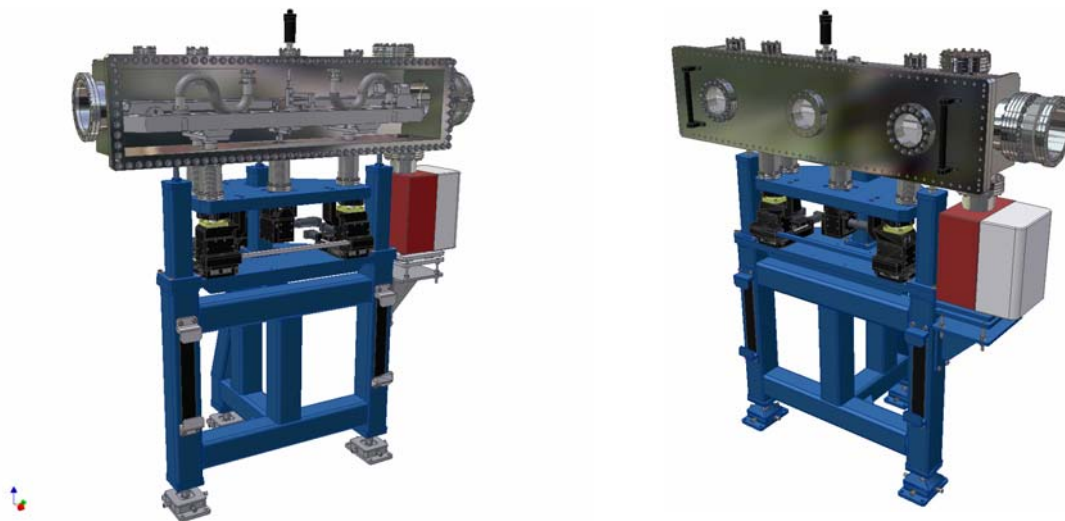
FIGURE 1 MIRROR SYSTEM DESIGN

Advanced Design Consulting USA, Inc. in collaboration with Case Western Reserve University, Center for Synchrotron Biosciences has completed the design of a bendable mirror for the X28C beamline. It is a 50 mm x 100 mm x 1100 mm single crystal silicon with a cylindrical cut with a radius of 43.1 mm bendable to a toroid from infinite to 1200 m radius. The unique feature of this mirror system is the dual use of Indalloy 51 as both a mechanism for heat transfer and a buoyant support to negate the effects of gravity.