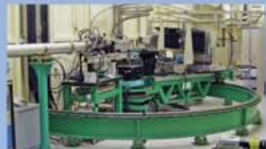
Spectrometer for Inelastic X-ray Measurements at SPring-8 - Japan