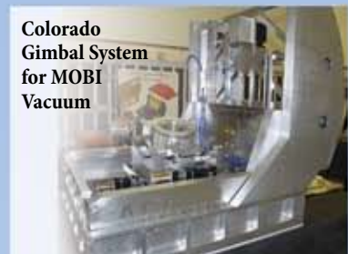
Colorado Gimbal System for MOBI Vacuum

EQUIPMENT with REALIABILITY and DEPENDABILITY