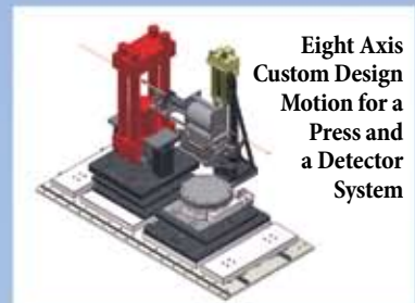
Eight Axis Custom Design Motion for a Press and a Detector System