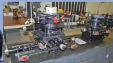
Ultra-Small-Angle Neutron Scattering (USANS) Monochromator Instrument for ANSTO - Australia

ADC developed a 5 axis positioning system device to facilitate research in the area of electron beam free form fabrication in microgravity. This process will be used to create replacement components for isolated equipment from raw material in wire form. Possible applications range from military equipment, to the ISS, to manned exploration of space. This system will provide a high precision manipulation system with both position and velocity control of the electron gun and substrate. Other requirements for this system include operation in vacuum as well as capacity for dealing with large heat loads from the welding process.